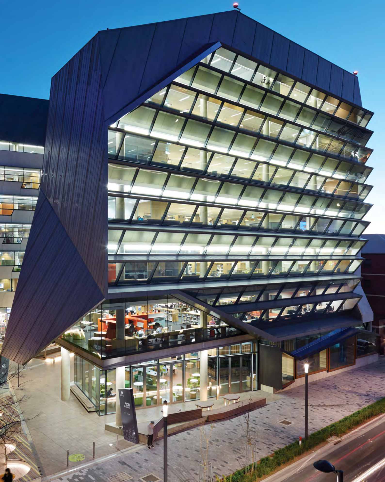
Image: The award-winning Jeffrey Smart Building at UNISA's City West campus.