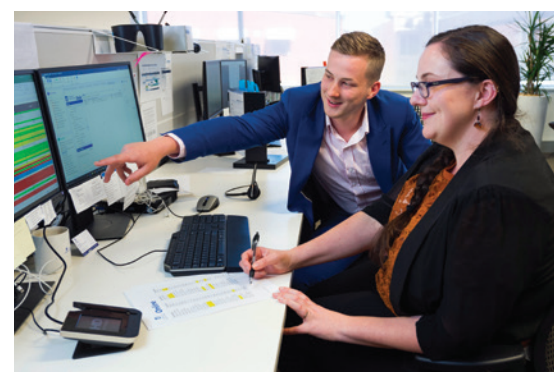
UniSA Online's student support team in action.